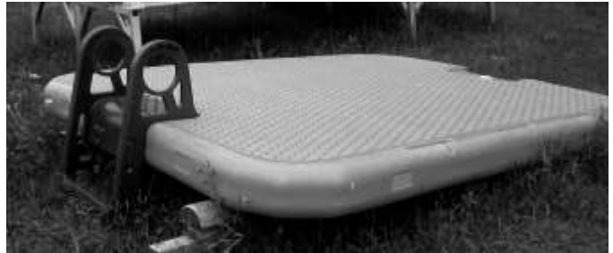
Swim platform donated by the Beulah Boosters

Swimmer's Itch Information can be found at the CLWA (Crystal Lake Watershed Association's website: www.clwa.us and in the Summer 2013 Beulah newsletter: villageofbeulah.org and click on archive newsletter. Please report incidents of 'itch' to the CLWA Hotline: 231-882-4001