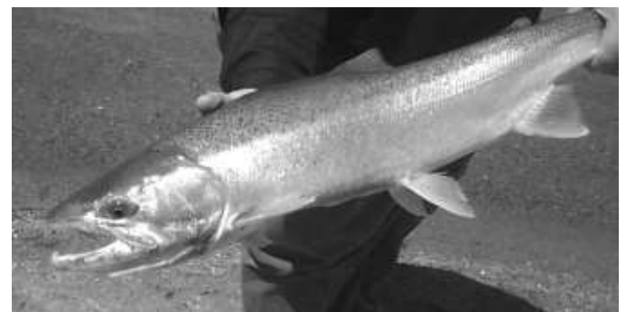
Shore fishing was good on this day in May.