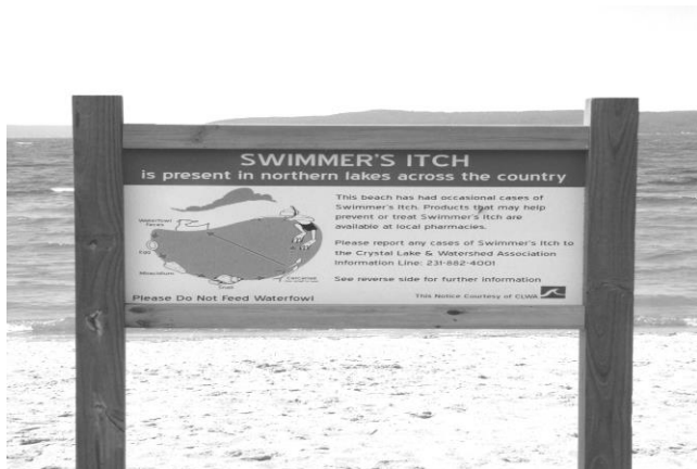
Swimmer's Itch information is posted at the beach. Rinse off and dry off ASAP.