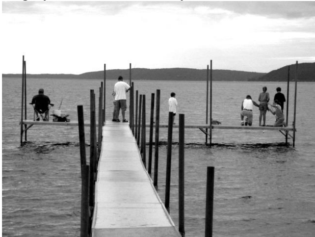
New and improved fishing dock will be in place in spring of 2014

Grant Updates: The Village received a matching grant from the Rural Business Enterprise as part of the USDA-Rural Development program. The entire grant covers: a new fishing/T-dock that will be installed in spring of 2014, irrigation for the green area near the boat launch (in process), additional mobility mat for waterfront access, refurbishing of the retaining walls on Lake St./across the Cold Creek and additional trash containers and wheel stops. The efforts to find funding sources for the streetscape work continue. As reported in earlier newsletter, a Transportation Grant is being developed in partnership with Gosling Czubak Engineering and a committee of Council members and Beulah Boosters. Public input was received earlier this spring. More opportunity for input will be offered after grant approval is received and more specific plans are developed. The goal is to submit the grant in August 2013. It is important to remember that the process is lengthy and could take 1-2 years.