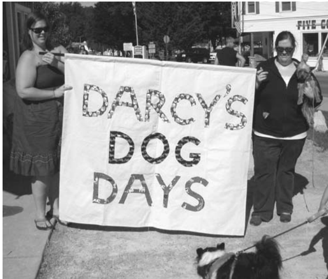
Many dogs brought their owners and family members to enjoy the Darcy Library's Dog Days event in June.

Landlords and Rental Agents: Please inform renters about the Friday trash pick up and how to get bags. Village and business trash receptacles and street receptacles are not intended for trash from private residences. Your support and help is appreciated. Let's keep our Village beautiful and clean.