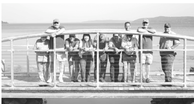
Setting the bridge over Cold Creek was fun

Grant updates: The MI Natural Resources Trust Fund project (Waterfront Restoration) is basically finished. Final details with planter pots, signage and the boardwalk