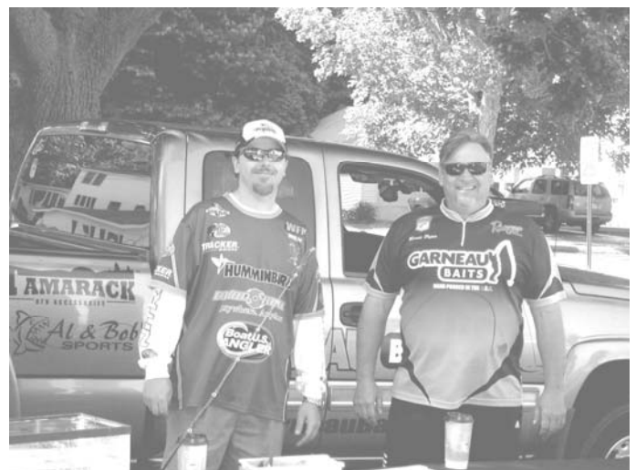
Nearly 30 youngsters got free fishing lessons at the Beulah Boosters Welcome to Summer Picnic