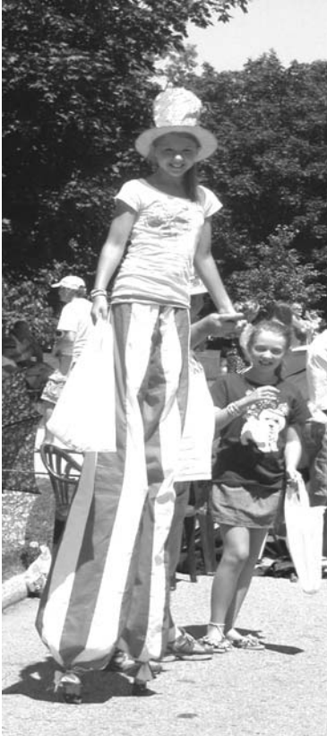
Patriotic 4 th of July fans come in all sizes