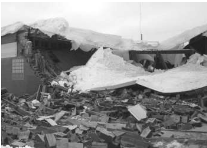
It was a sad day for many when the roof on the bowling alley collapsed. Many memories were shared. Clean up has started.