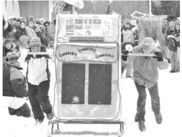
Best in Show Outhouse went to The Corner Pub's Juke Box entry, racing to the 'oldies'!

Another beautiful fireworks display on Crystal Lake ended the day. The CLCBA thanks all its members, volunteers and participants.