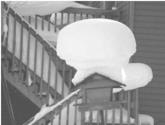
This photo gives a new meaning to the term 'snowbirds', any wonder they head south!