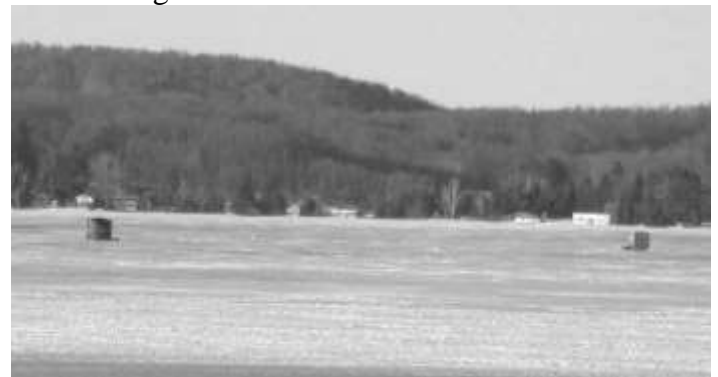
Daytime only rules in place for ice shanties

Dock Space has a waiting list; contact Laurie at the Village Office for info. 231-882-4451.