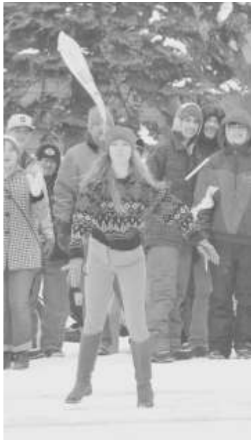
High flying fish toss at Winterfest!