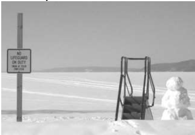
Perhaps we do have a lifeguard on duty!