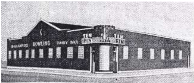
The Ten Pin Bowling Alley as it looked when it opened in the Fall of 1944.