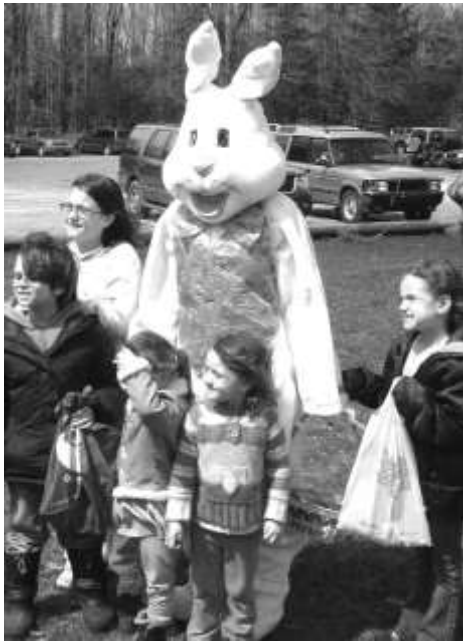
Easter Egg Hunt at Memorial Park in Benzonia, Sat., April 19, 1 pm For toddlers to age 12