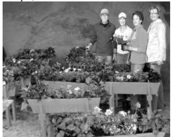
Beulah Boosters planted, painted and cleaned.