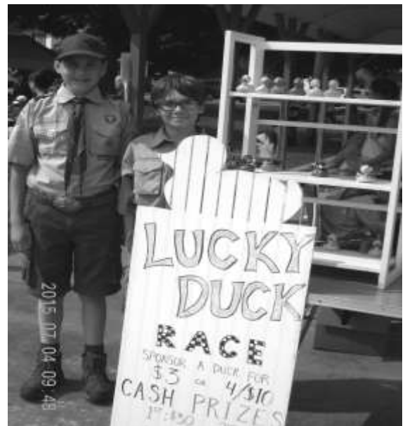
Troop 10 scouts were busy working several events on the 4 th of July and doing clean up. Thanks to the Scouts and their leaders!

4 th of July in Beulah: Blue skies and sunshine brought many people to the parks, beaches and sidewalks of Beulah for the 4 th of July events. Over 600 people ran in the Firecracker 5K race and the Family Fun Run. The park was busy with food, music, face painting, greased pole climbs, rubber ducks and coin hunts on the beach. Nearly 60 entrants for the parade made it exciting and colorful as floats, cars, bands and outhouses were paraded, just to name a few. Parade winners were: 1 st The Corner Pub's Tiki Bar/Outhouse, 2 nd Benzonia Township Firetrucks and 3 rd Jowette Funeral Home