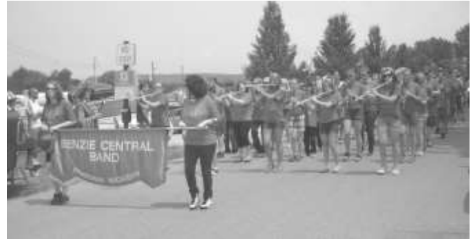
Parades are always better with a marching band!

the goal of having nutrient rich soil available next season. Please go to GrowBenzie.org or call 882-9510 for more information on how to participate. Congratulations to these organizations to collaborate for the environment and Benzie County.