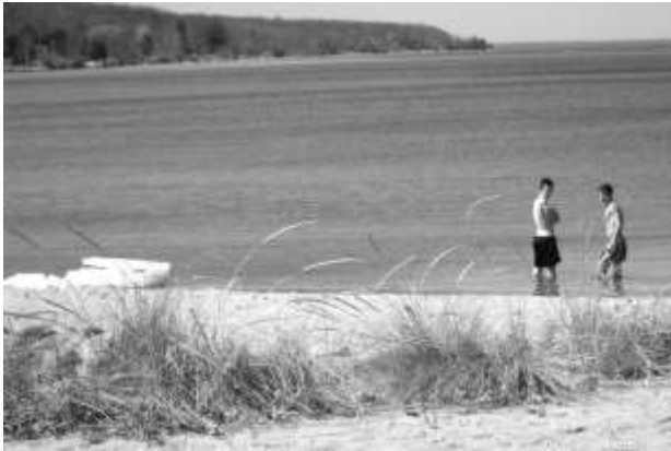
Teens “enjoyed” beach time on a recent Sunday. No worries about sharing the beach with lake ice not ready to give up on winter!

Remember the One Way Streets Clark St. is one way between Lake St. to Benzie Blvd. Lake St. is one way northbound, Prospect to Clark. Tickets will be issued. Drive safe!