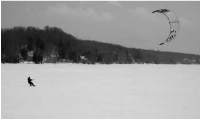
Earlier this winter, thick ice and wind were a source of entertainment for this kite boarder.

Cross Connection Prevention Program The Village of Beulah Winter 2015 Newsletter contained a brochure that explained water cross connection and the potential danger it creates for village drinking water . If you didn’t get the flyer, copies available at the Village Office. The Cross Connection Inspection Program, a requirement of the Michigan Department of Environmental Equality (DEQ), is an ongoing program throughout the State of Michigan. Each Village water customer will receive a notice requesting a time when the Village crew can perform a brief plumbing inspection to determine if a potential cross connection hazard exists. Should a potential hazard exist, a recommendation will be made to correct it. For the safety of all Village residents’ drinking water, your cooperation is needed. Thank you! Dan Smith, Sewer/Water