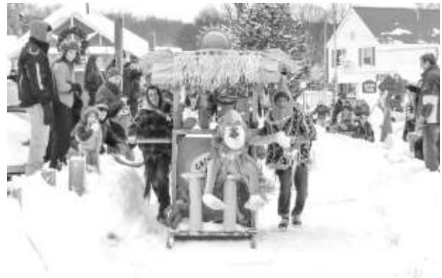
Best in Show Outhouse went to The Corner Pub's Tiki Outhouse

Sponsors of special events that require Village support, such as barricades or staff, should make a request to the Council using the Event Request form available from the Village Office or web site.