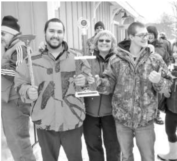
Winning the Outhouse Race was Team Benzie Recycling

Fireworks on Crystal Lake ended the day. The CLCBA thanks all its members, volunteers and participants. The Benzie County Showcase was also cancelled and the committee is determining their next steps with their event.