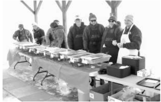
Beulah Boosters were serving chili for nearly 100 voters at the belated WinterFest event